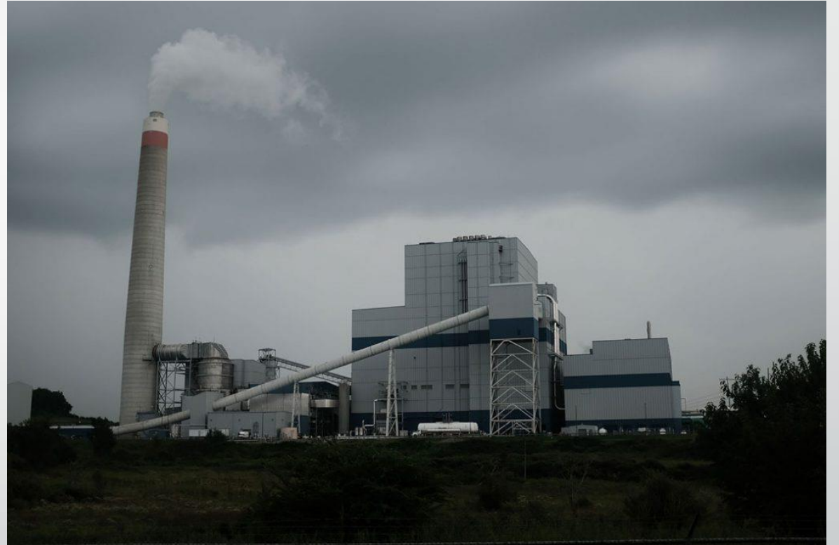
A coal-fired plant is seen in West Virginia on August 21, 2018.