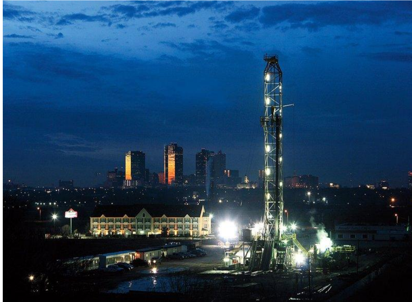
Ft Worth, TX