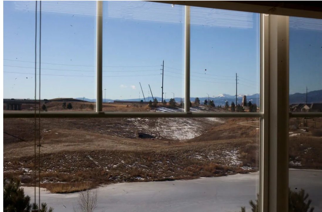
View outside of Laurie Anderson's house of the well pad