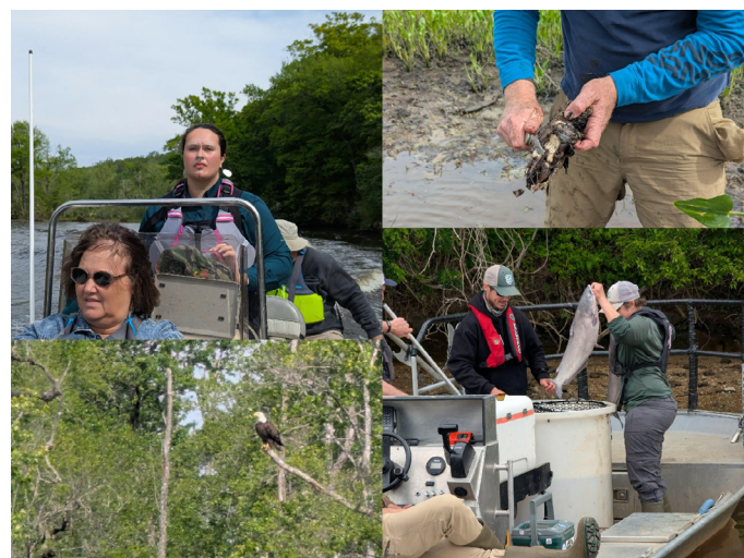
Upper Mattaponi Tribe River Trip

The Upper Mattaponi Tribe of Virginia hosted a river trip for its Tribal citizens along the Mattaponi River. Through partnership with the Department of Wildlife Resources and the Virginia Institute of Marine Science, various sampling and field science methods were displayed, including electroshocking the water for fish sampling and plant ID. This is an annual trip that the Tribe hosts to promote Tribal citizens to interact and understand their namesake river.